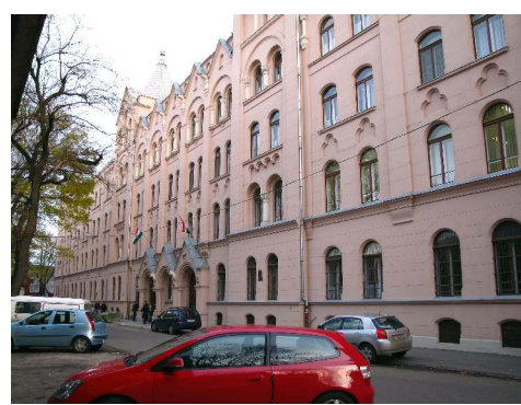
2. Faculty of Arts Building, venue of all the sessions (at its corner: Café "Agár Úr," venue of the opening reception)