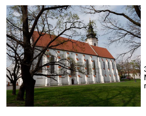
3. The Franciscan Church, Monastery, and Museum, much worth the visit