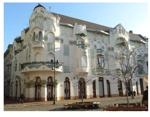
1. Conference opening and Keynote 1 in the REÖK Gallery, the faboulous Art Nouveau house