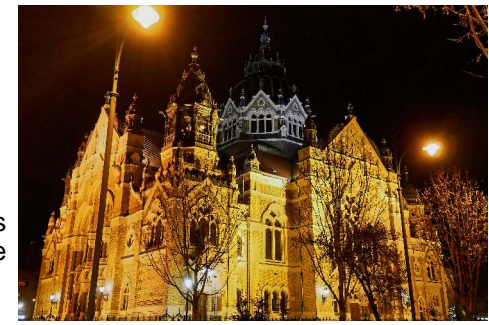
4. The world famous Art Nouveau Synagogue